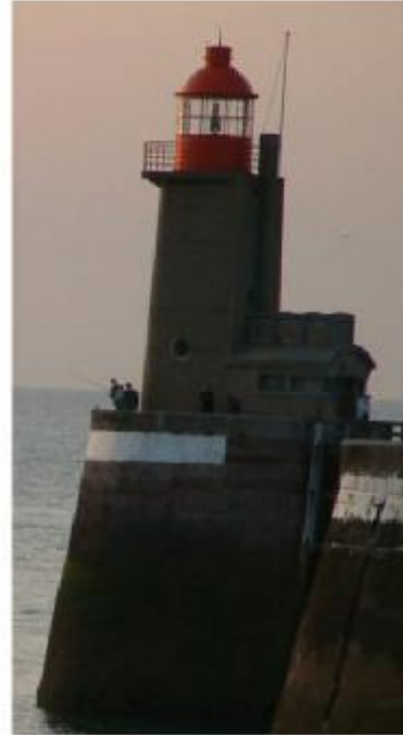
A lighthouse, but where?