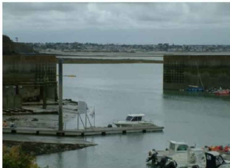
A little used harbour entrance