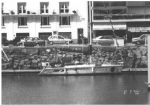
Where is Adat?