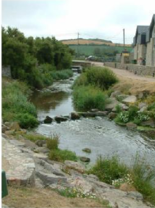
Where is this stream?