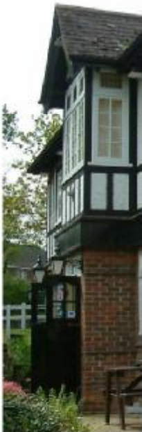
The doors are open, but where?