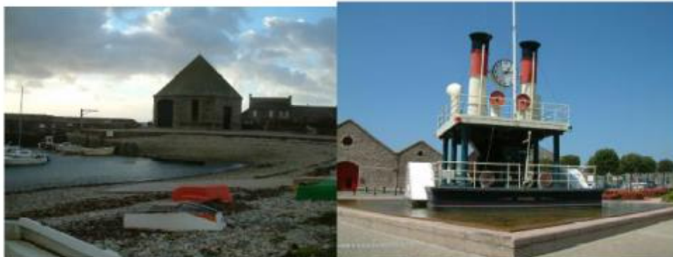
Paynter's Puzzles: Where is the harbour? And where is the clock. How does it go?