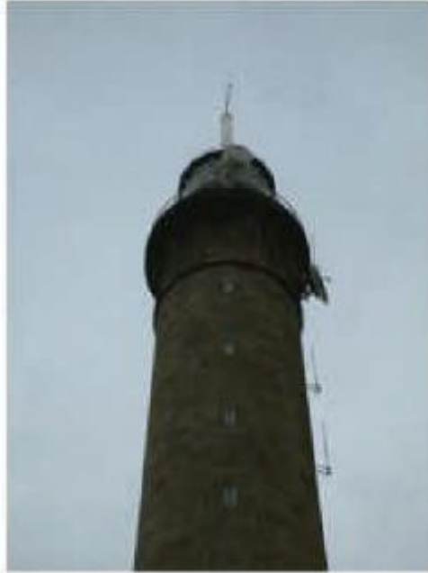
A famous landmark, where?