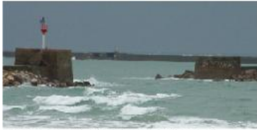
Which popular harbour entrance?