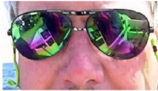
Who is this member of YOSC?