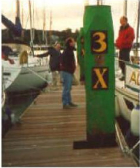
Adat, But where?