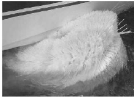
What is this? Where can you find one?